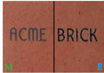
Red Rustic (WG30)