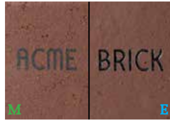
Dark Antique (WG33)