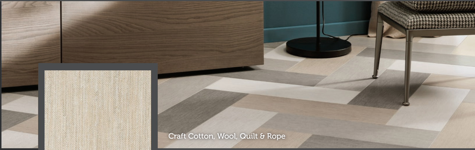
Craft Cotton, Wool, Quilt & Rope