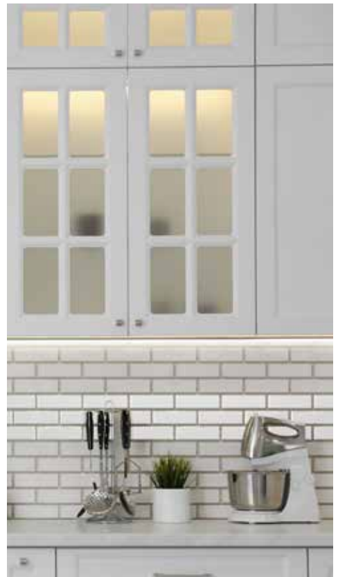
Panama City Matte, Glossy inset