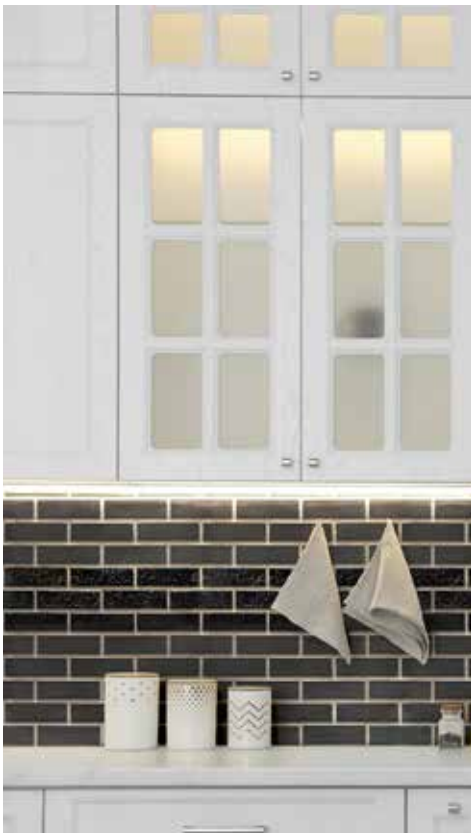
Basalt Matte, Glossy inset