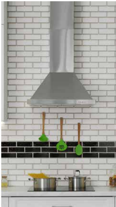
Panama City Gloss, Basalt Glossy inset