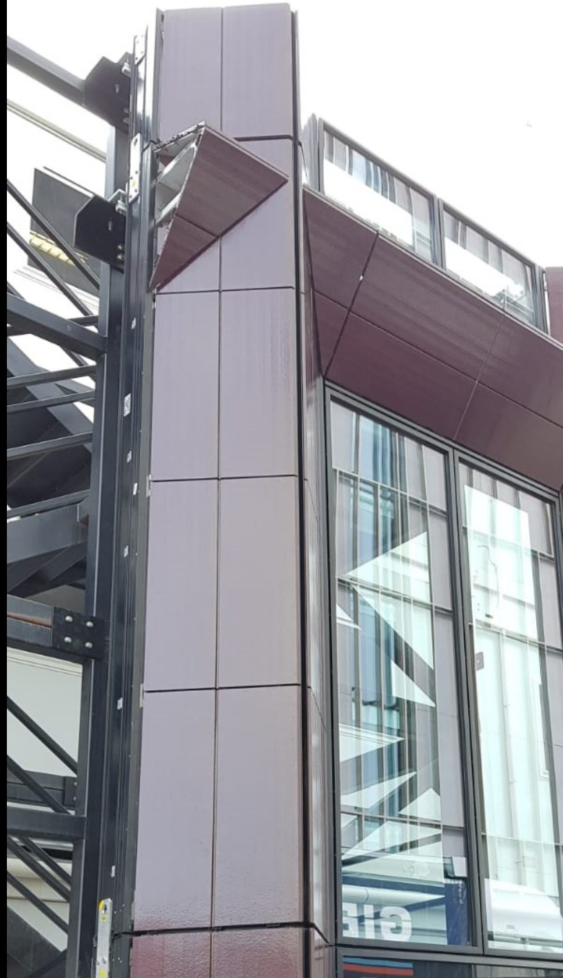
Visual Mock-up on site