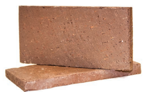
Traditional Edge PaverTile