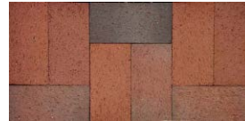
Pathway Full Range