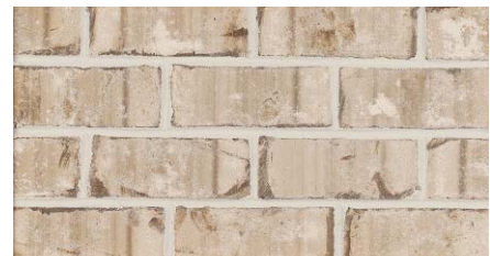
Oyster Pearl OS