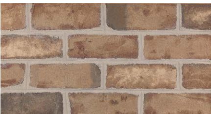
Old Irvington OS