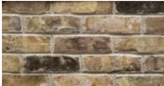
Old Chicago Reclaimed