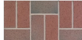
Pathway Full Range modular