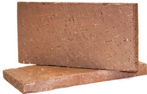
Traditional Edge PaverTile