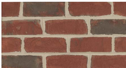
Old Yorktown OS