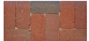
Rumbled Full Range 4x8