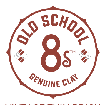
VINTAGE THIN BRICK