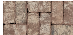
Rumbled Bluff 4x8