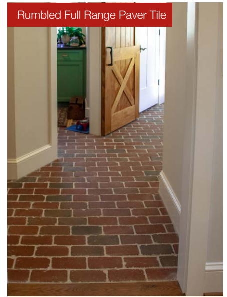
Rumbled Full Range Paver Tile