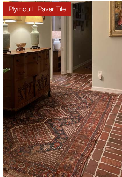
Plymouth Paver Tile

Paver Tiles™ are 1/2" or 3/4"* clay brick tiles that install like traditional ceramic tile. They allow homeowners to bring the timeless appeal of clay brick to spaces with height or weight restrictions. Paver Tiles are great for interior projects or rehabilitating outdoor spaces and are available in all of Pine Hall Brick's popular clay paver colors and textures.