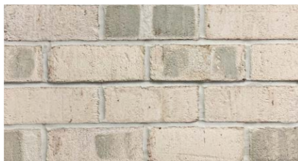
Chesapeake Pearl OS