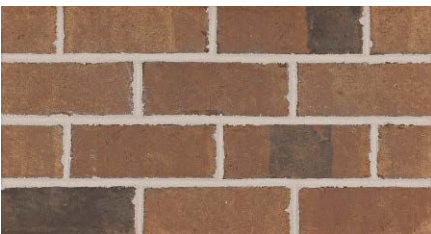
Browns Ferry OS