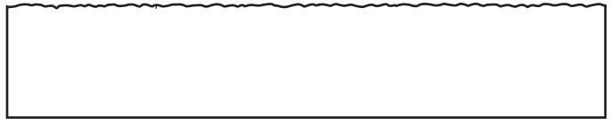
2" (50.8mm) Section Profile

Short Sheet Dim.: 98.42" (2500mm) X 49.21" (1250mm)