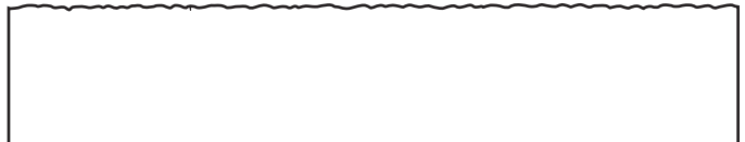
2" (50.8mm) Section Profile

Short Sheet Dim.: 98.42" (2500mm) X 49.21" (1250mm)