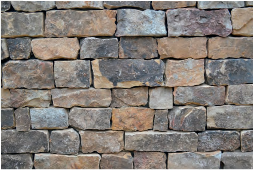
WEATHERED LEDGE™ 3" TO 6"