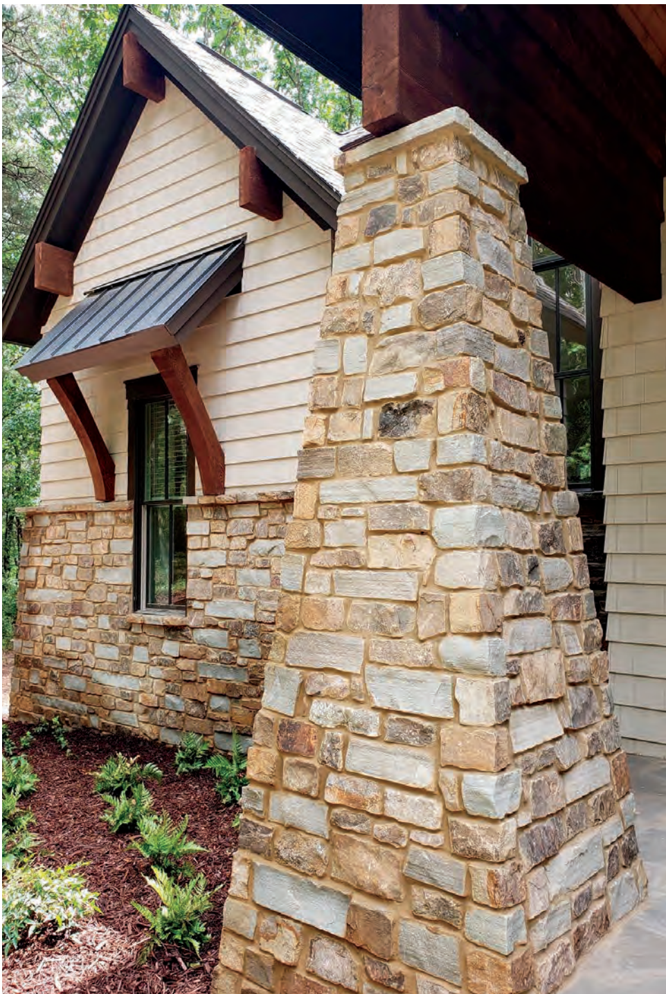
LB GREY 50% WEATHERED LEDGE 50%