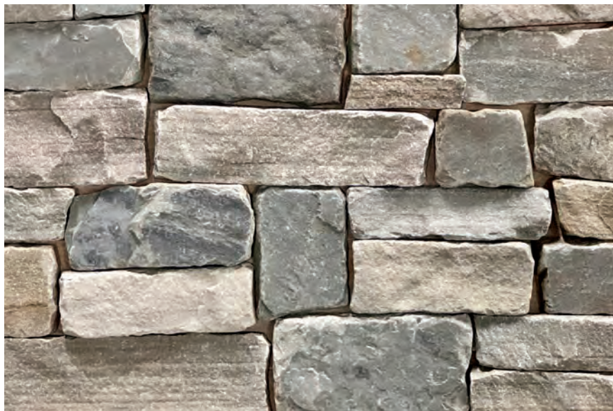
RUSTIC BUFF GREY™