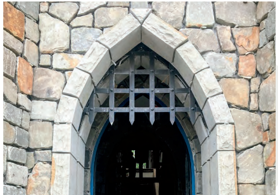
CUT TO JOB