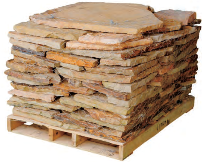
FLAGSTONE 1" - 2" BROWN