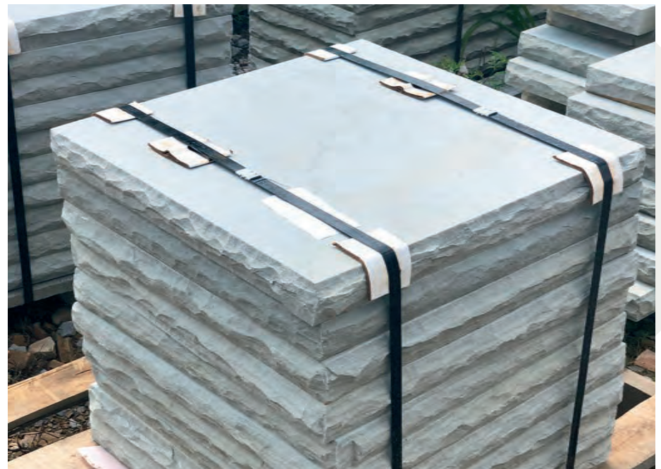
SAWN TOP: 20" x 20" x 2 1/4" PITCHED & NATURAL TOP: 20" x 20" x 2" - 3" SNAPPED & SINGLE PIECE HEARTHES: CUT TO JOB