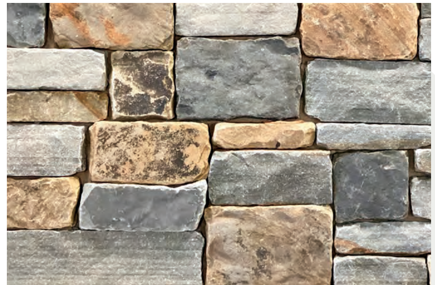
RUSTIC BUFF BLEND™