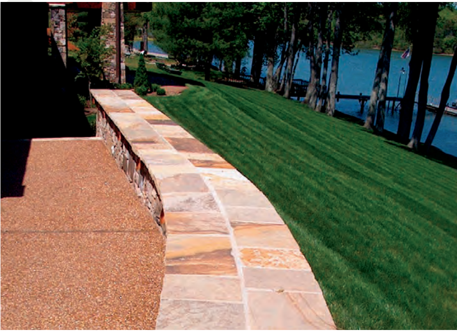
12" WIDE x RANDOM LENGTHS x 2"- 3" IN