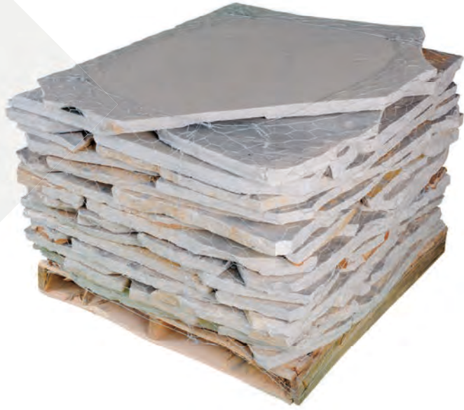
FLAGSTONE 1" - 2" GREY