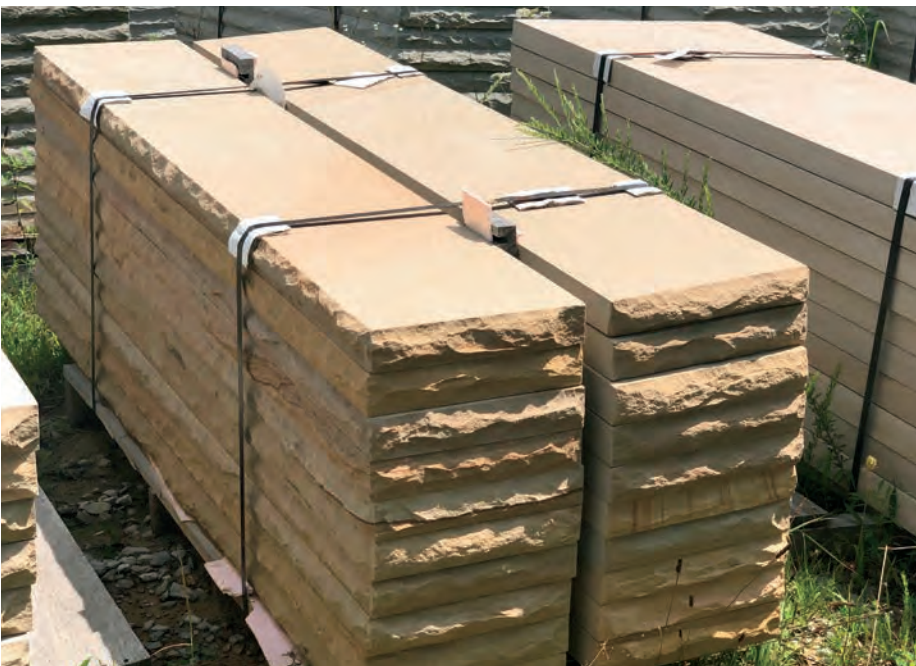
SAWN TOP: 10" x 60" x 2 1/4" PITCHED & 10" x 72" x 2 1/4" PITCHED & NATURAL TOP: CUT TO JOB