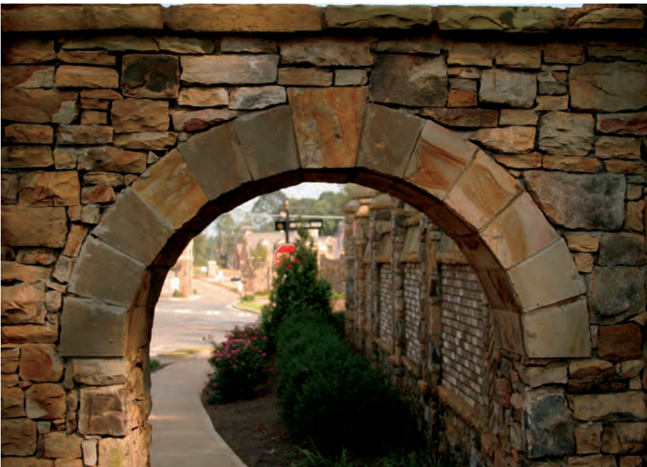
CUT TO JOB