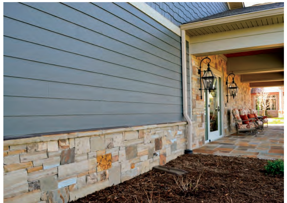
3" x 18" x 2 1/4" PITCHED & 3" x RANDOM LENGTHS x 2"- 3"