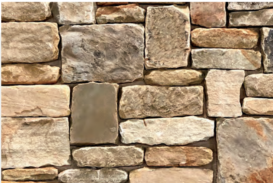
RUSTIC BUFF BROWN™