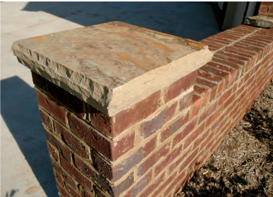
CUT TO JOB