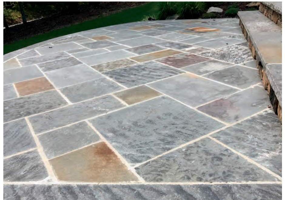
CUT TO JOB