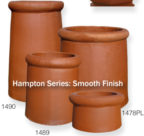
Hampton Series: Smooth Finish

Rain Guards - Available in Stainless or Copper