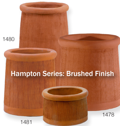
Hampton Series: Brushed Finish