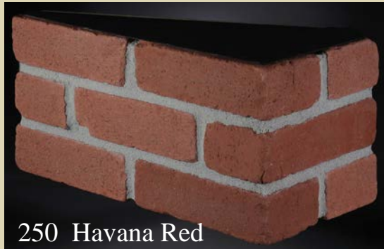
250 Havana Red