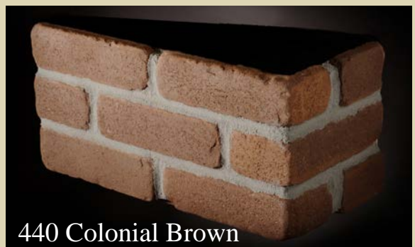
440 Colonial Brown