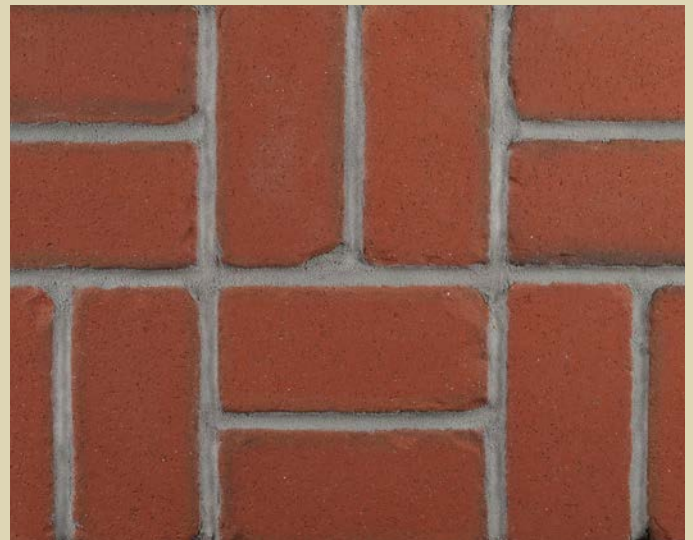
300 TAVERN FLASH