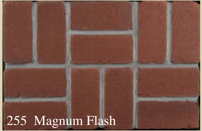
255 Magnum Flash