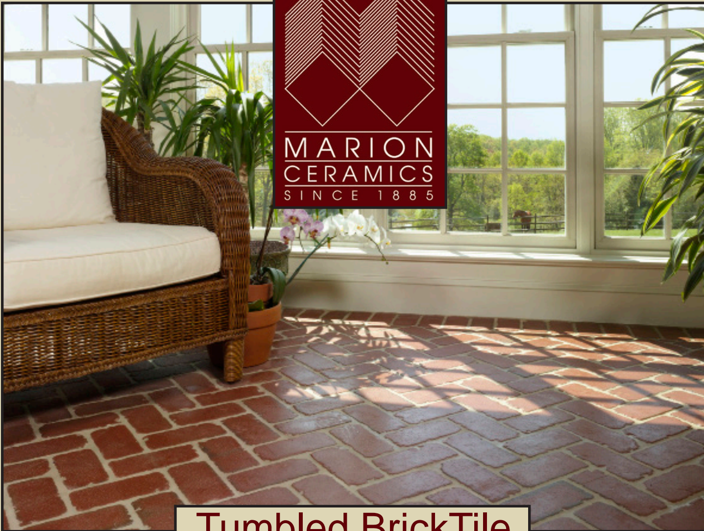
Tumbled Brick Tile