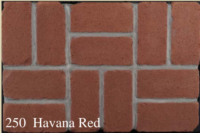
250 Havana Red