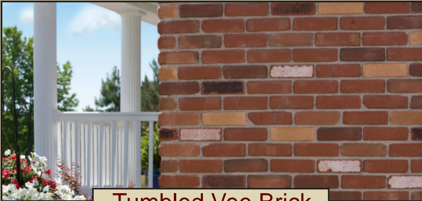
Tumbled Vee Brick Hard Fired Clay Products