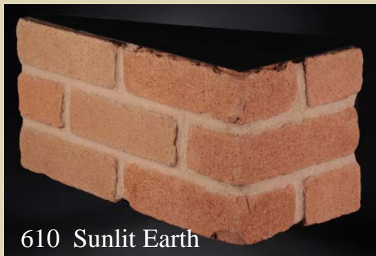
610 Sunlit Earth