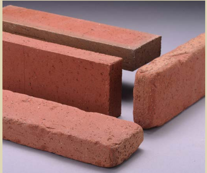
SQUARE EDGE AND TUMBLED PRODUCTS

Tumbled products with white and black coatings are available on each of our five unflashed body colors. This capability is a significant subtlety for achieving the look of a truly authentic used brick product. Additionally, we are blending these products to capture the variety and appeal of flashed, unflashed, whites and/or blacks from one or more body colors. We offer standard and custom blends. The design possibilities for beautiful variegated color blends with our tumbled products are unlimited.