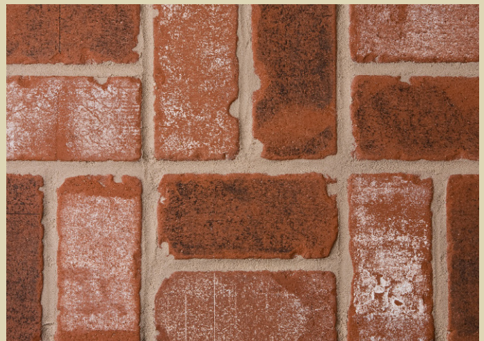
WHITE/BLACK (200 BODY)