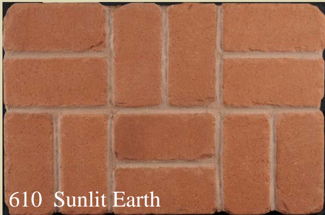
610 Sunlit Earth