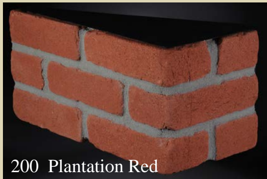
200 Plantation Red