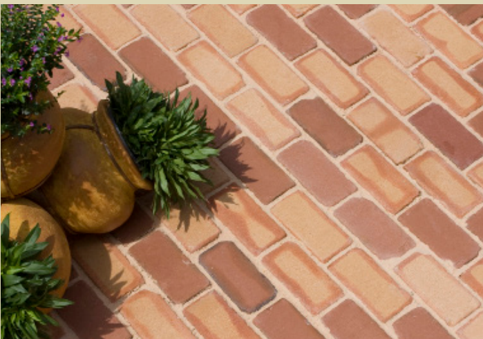
MOJAVE DESERT (50% Color 655; 50% Color 675)