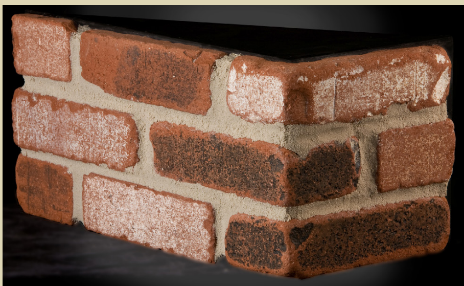
WHITE/BLACK (200 BODY)