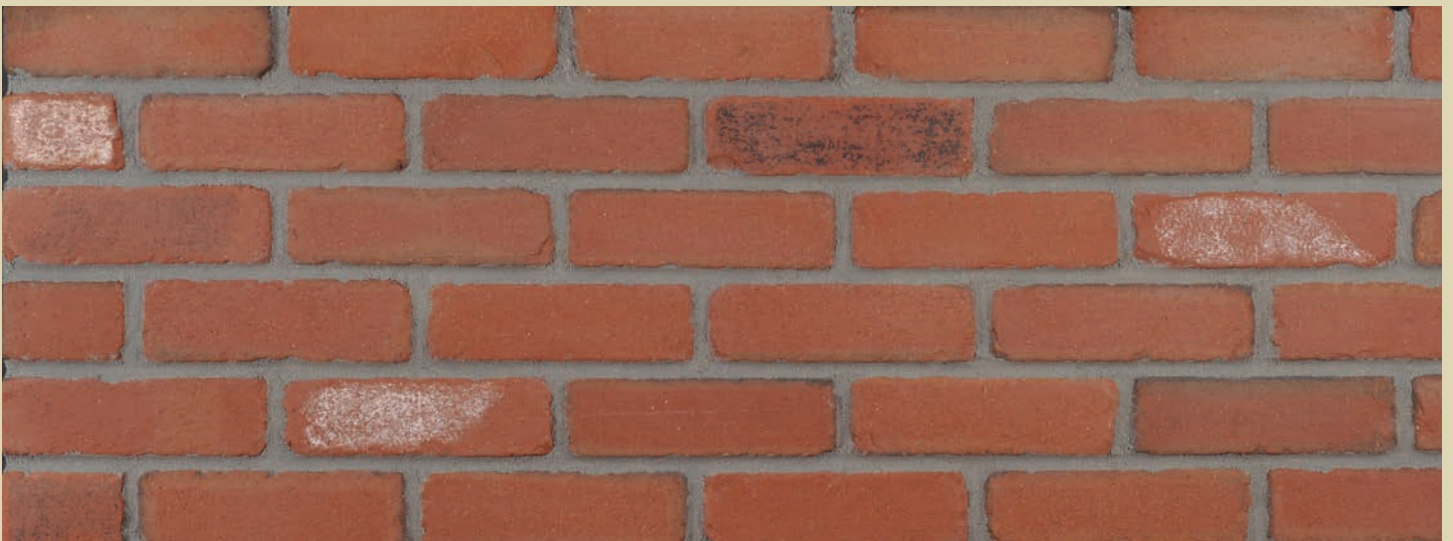
CHARLES TOWN (70% Color 300; 20% Color 200; 10% White/Black 200 Body)