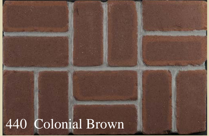
440 Colonial Brown