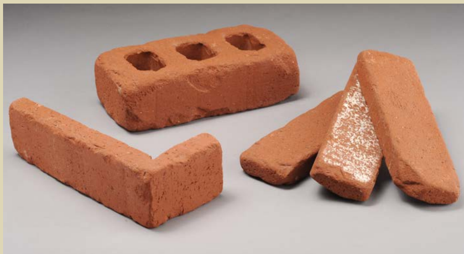
TUMBLLED VEE BRICK PRODUCTS

Also, as noted Marion offers Tumbled BrickTile which is the closure size for vertical veneer brick applications. Matching closure size tumbled corners and face brick are available by special order.