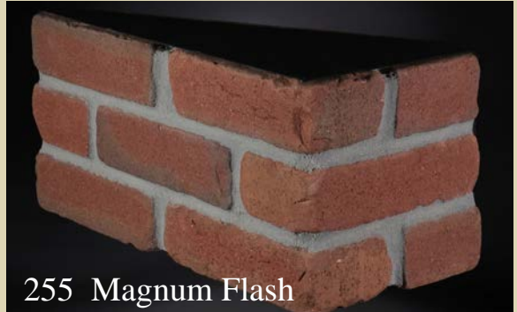
255 Magnum Flash