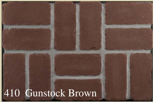
410 Gunstock Brown