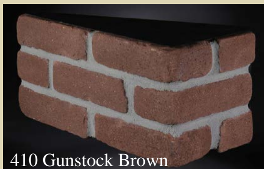
410 Gunstock Brown