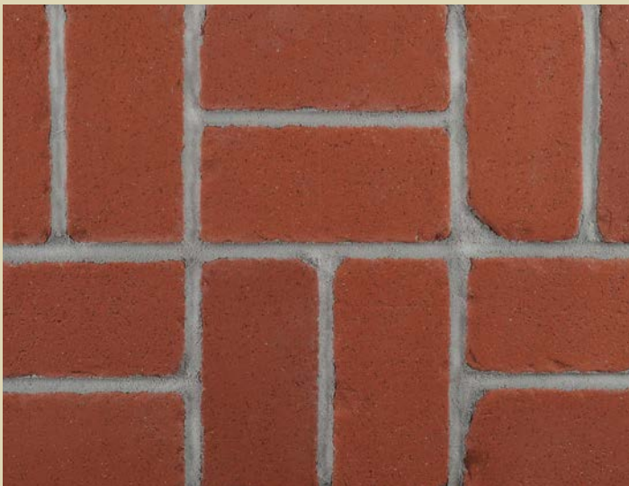
200 PLANTATION RED

Importantly, architects, designers and owners should keep in mind that Tumbled BrickTile work well for driveways with proper bonding to a rigid base (slab). The design possibilities are unlimited and offer a wonderful alternative to imperfect flexible base installations or the dull monotone of a concrete slab.