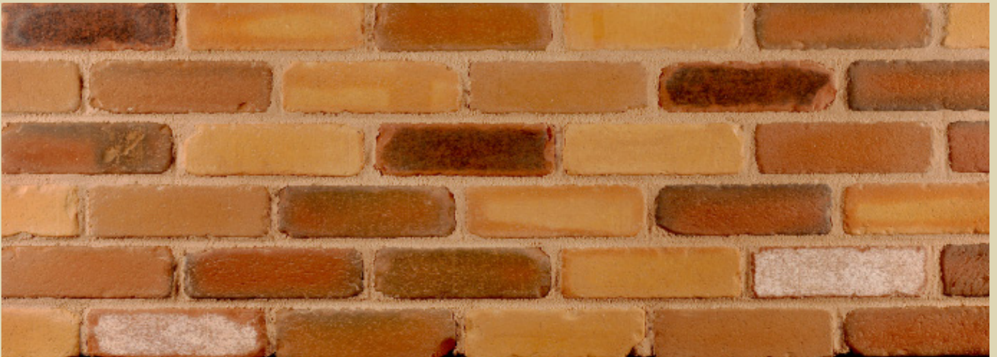
TUSCANY (40% Color 675; 40% Color 655; 10% Color 600; 10% White/Black 200 Body)