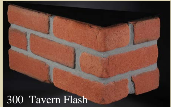
300 Tavern Flash