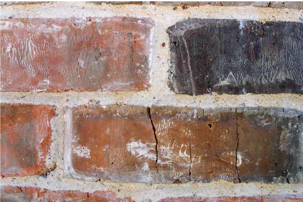
Figure 2. Close-up of a brick in that wall with dryer cracks.