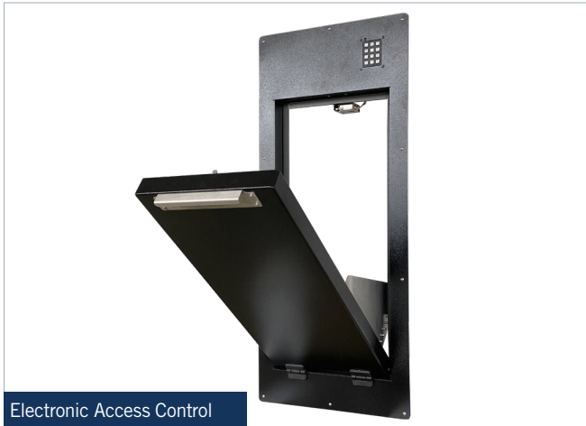
Electronic Access Control