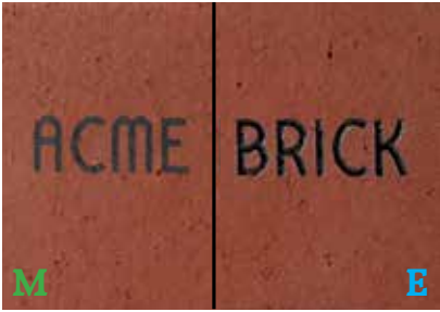
Red Rustic (WG30)