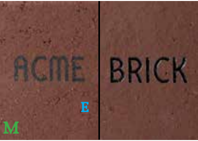
Dark Antique (WG33)