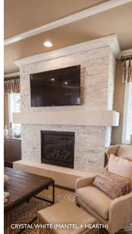
CRYSTAL WHITE (MANTEL + HEARTH)