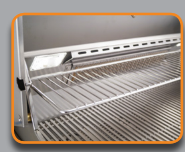
HEAVY DUTY WARMING RACK