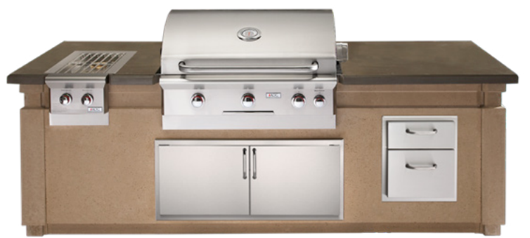
Model #: DC790-CBD-108SM (with Double Drawer) GFRC Island with Café Blanco base & Polished Smoke top