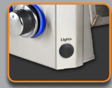
ON/OFF LIGHT CONTROL BUTTON ("L" SERIES)