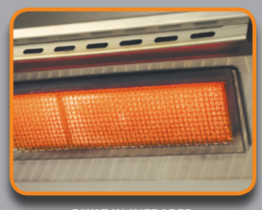
BUILT-IN INFRARED BACKBURNER