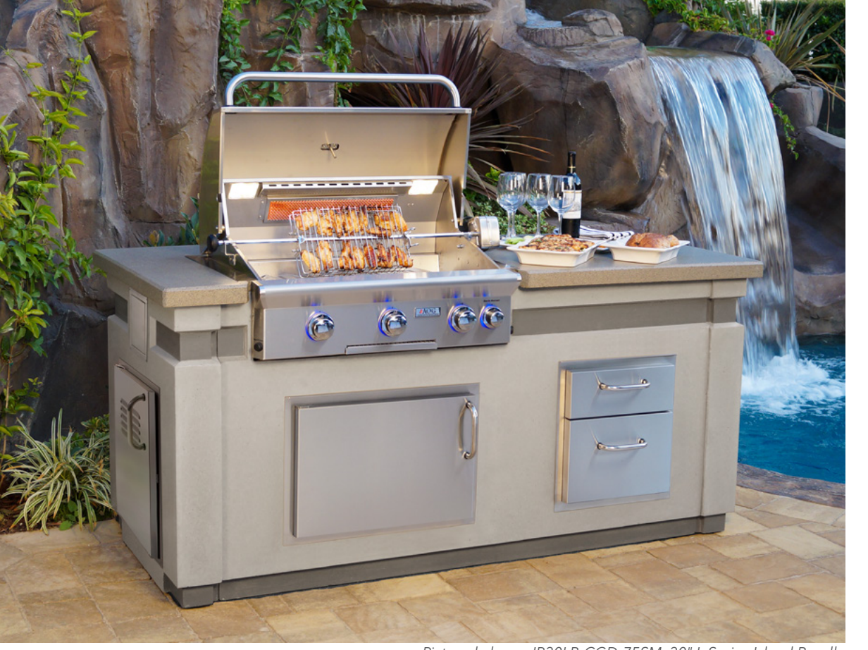
Pictured above: IP30LB-CGD-75SM, 30" L-Series Island Bundle