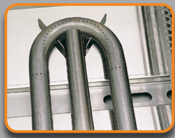
304 STAINLESS STEEL