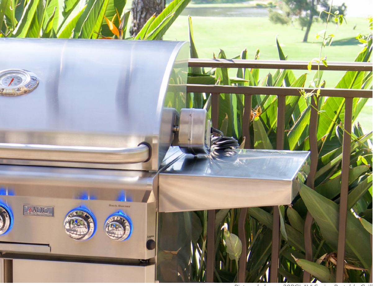
Pictured above: 30PCL "L" Series Portable Grill