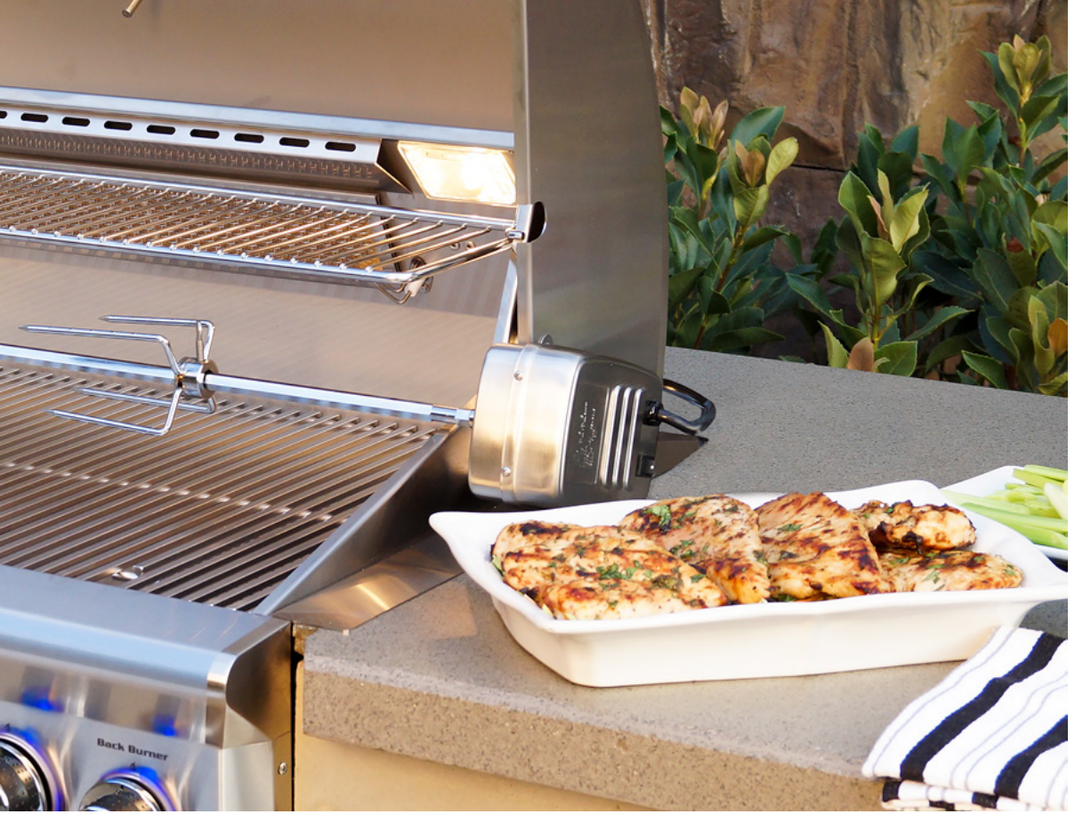
Pictured above: 30NBL "L" Series Built-In Grill