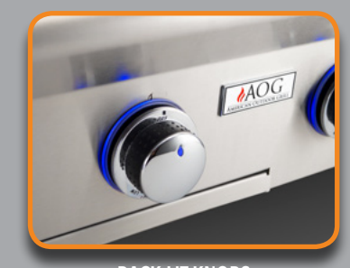
BACK-LIT KNOBS ("L" SERIES)