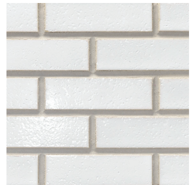
Panama City glossy