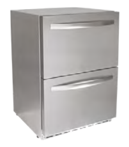
Two Drawer Refrigerator - REFR4 Trim Kit: RTR4 5.3 Cu. Ft., two drawer, stainless steel construction, certified for outdoor use, interior lights & LED controls. Overall: 34"H X 24"W