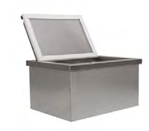
Drop-In Cooler - VIC2 304 Stainless steel, fully insulated, includes strainer & plug. Overall: 13"H X 23" W