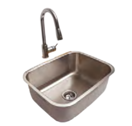
Stainless Undermount Sink - RSNK2 Single handle pull-down faucet, strainer, 360° swing angle, 18-gauge, hot & cold water. Overall: 21" x 15"

Stainless Sink - RSNK1 Double faucet, strainer, 23 gauge stainless. Overall: 15" x 15"