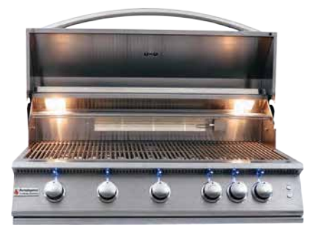
40" Premier Grill - RJC40AL Upgraded with Dual Interior Halogen Lights & LED Illuminated Control Knobs.