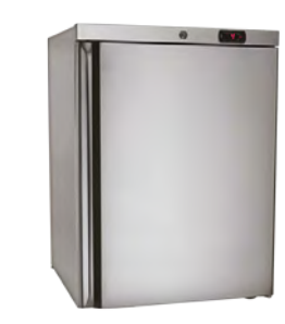
Refrigerator - REFR2 Trim Kit: RTR2 5.6 Cu. Ft., reversible door, stainless steel construction, certified for outdoor use, LED adjustable thermostat & locking door. Overall: 32"H X 24"W