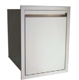
Double Trash Drawer - VTD2 Overall: 20"W x 27 1/4"D x 27"H Includes two bins.