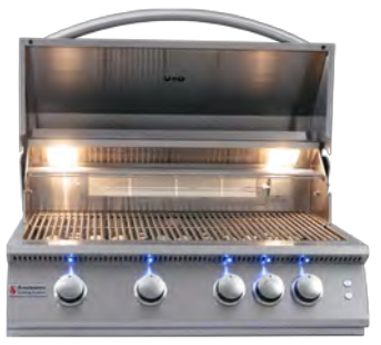
32" Premier Grill - RJC32AL Upgraded with Dual Interior Halogen Lights & LED Illuminated Control Knobs.