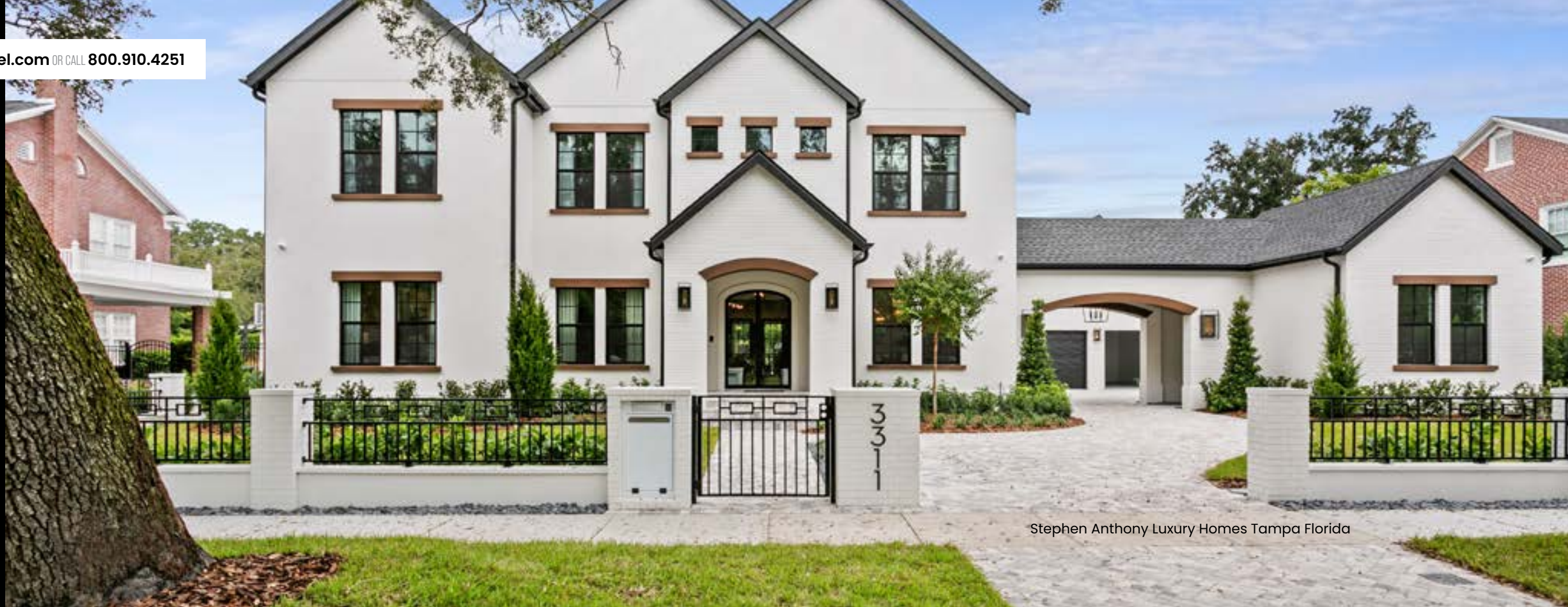
Stephen Anthony Luxury Homes Tampa Florida