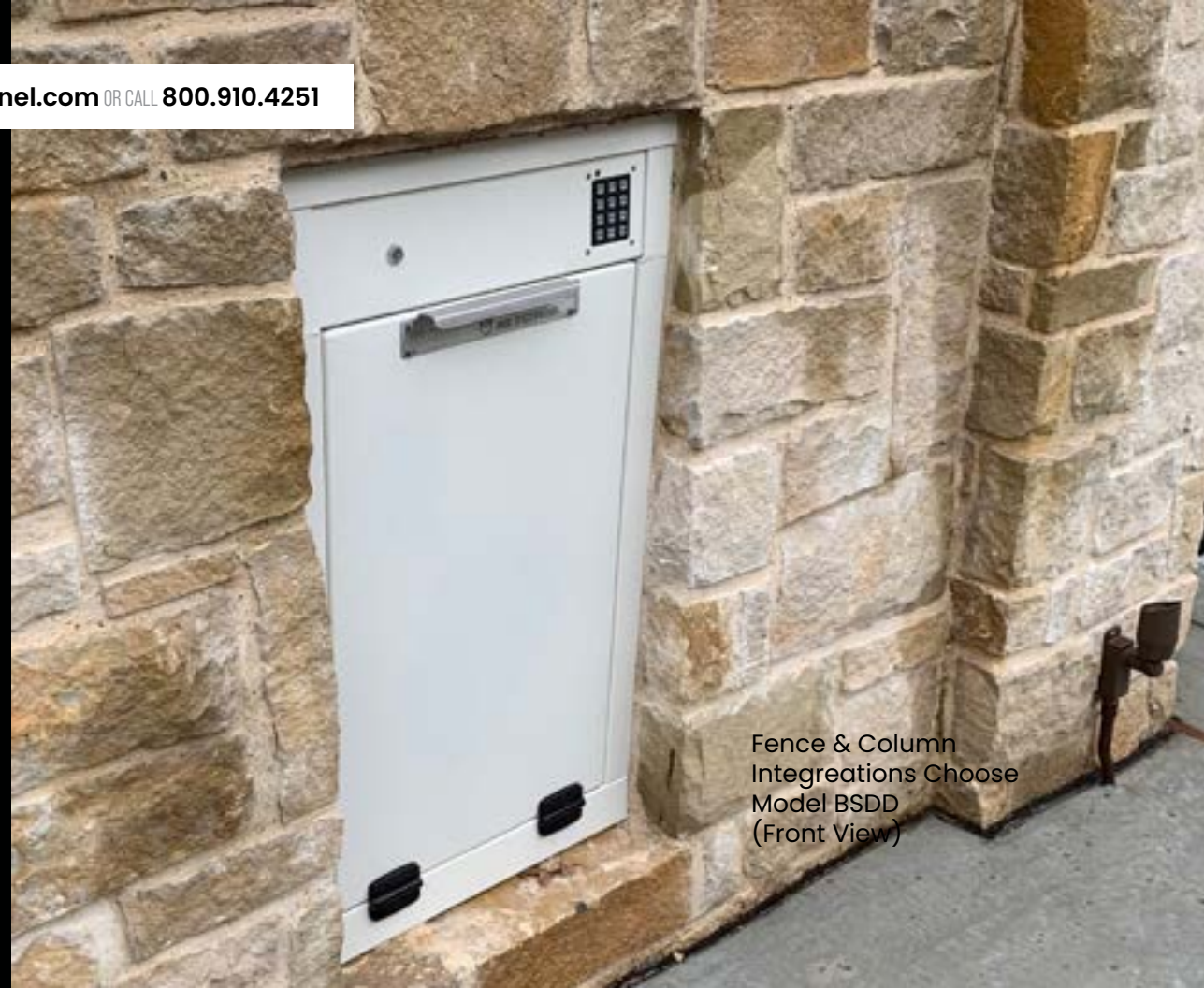
Fence & Column Integrations Choose Model BSDD (Front View)