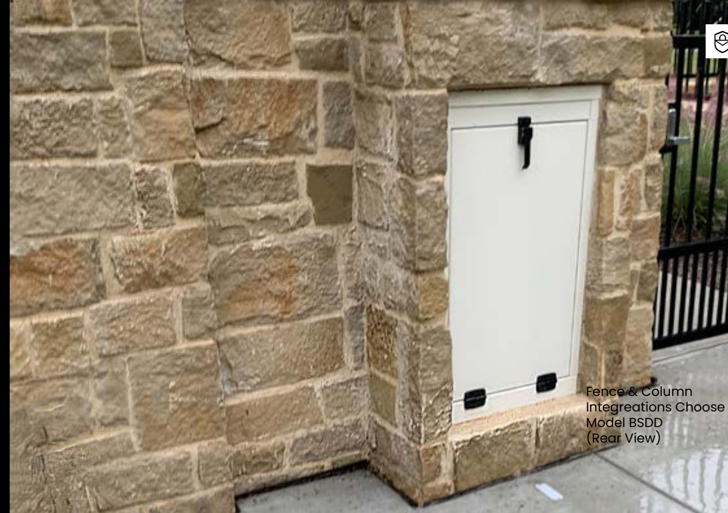
Fence & Column Integrations Choose Model BSDD (Rear View)