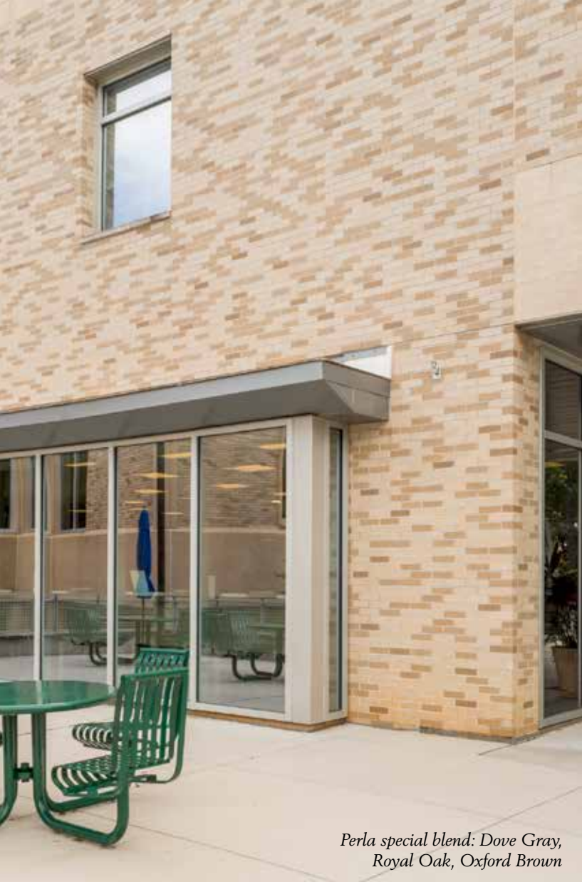
Perla special blend: Dove Gray, Royal Oak, Oxford Brown