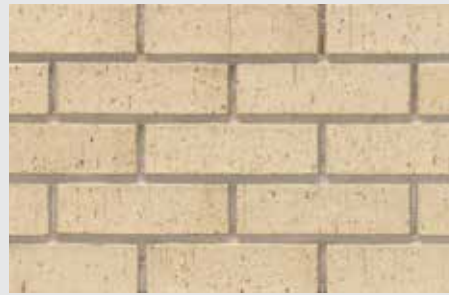
French Vanilla Medium (412)