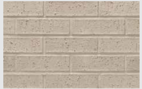
Steele Gray (160)