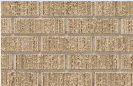
Mission Two (502)