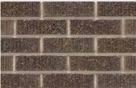
Mission Five (505)