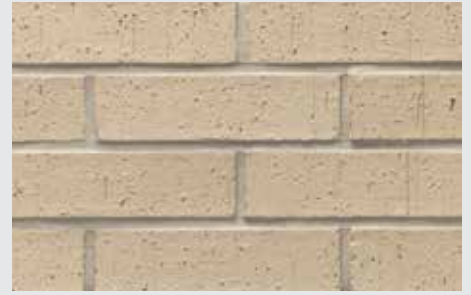
Dove Gray (030)