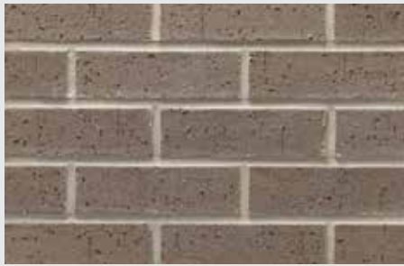
Slate Gray (167)