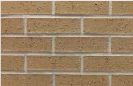
Oxford Brown (600)