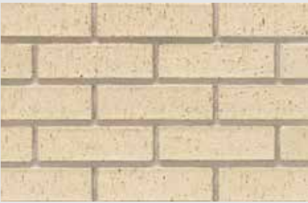
French Vanilla Light (411)