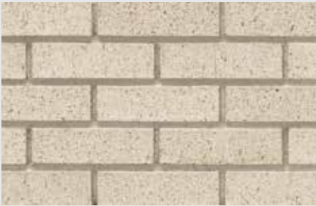
Southern Classic (051)