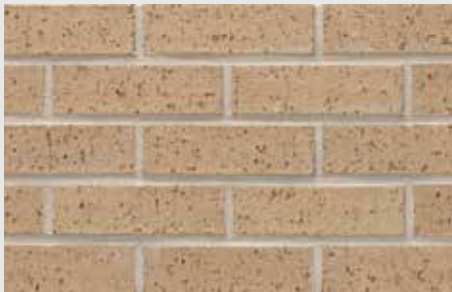
Royal Oak (250)