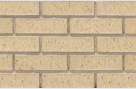
Alluvial Light (131)