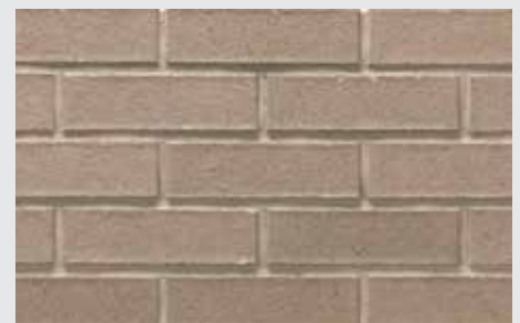
Marble Gray (166)