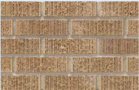
Mission Three (503)