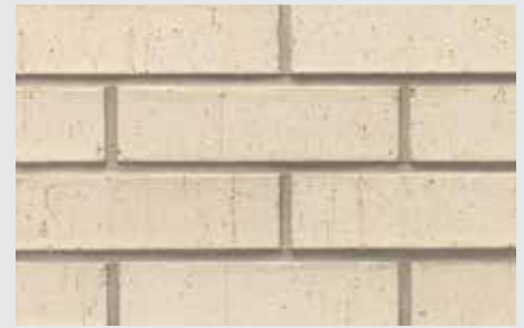
Glacier White (050)