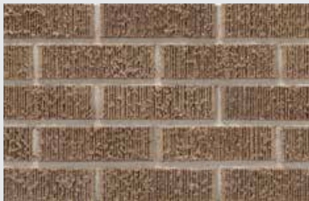
Mission Four (504)