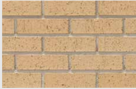
Alluvial Medium (132)