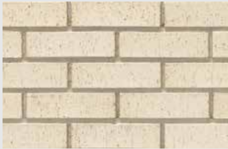
Rustic White (055)