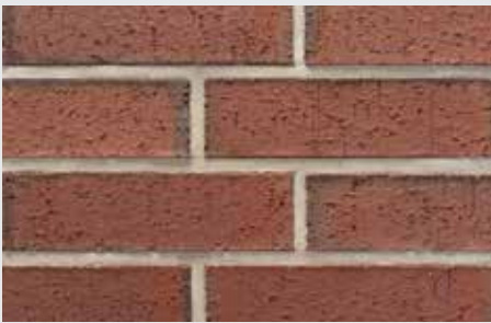
Summer Vineyard (035)