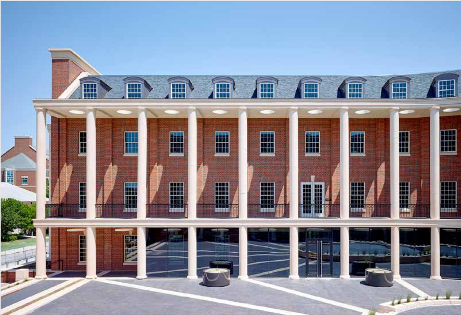
Oklahoma State University Campus custom blend