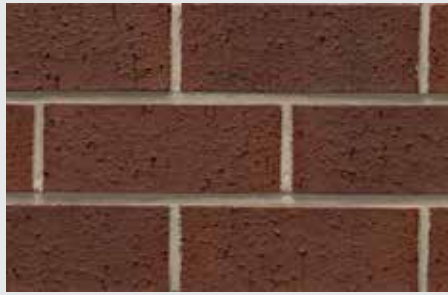
Napa Valley (033)