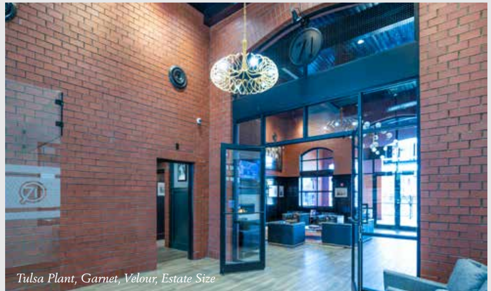
Tulsa Plant, Garnet, Velour, Estate Size