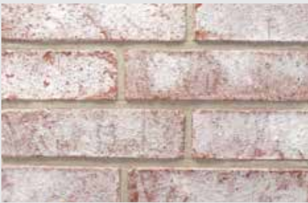
Coventry Cottage (892)