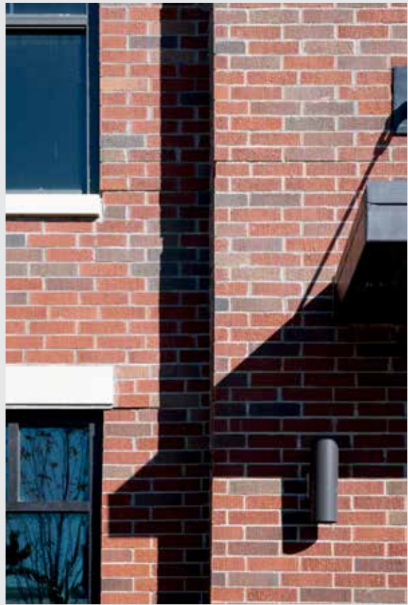
above: Tulsa Plant special blend, King Size, Ruff