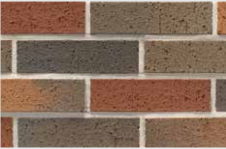
Merchants Mill (010)