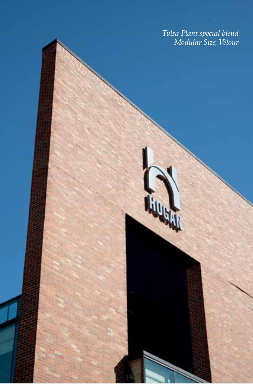
Tulsa Plant special blend Modular Size, Velour