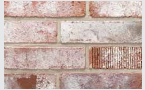
Bourbon Street (889)