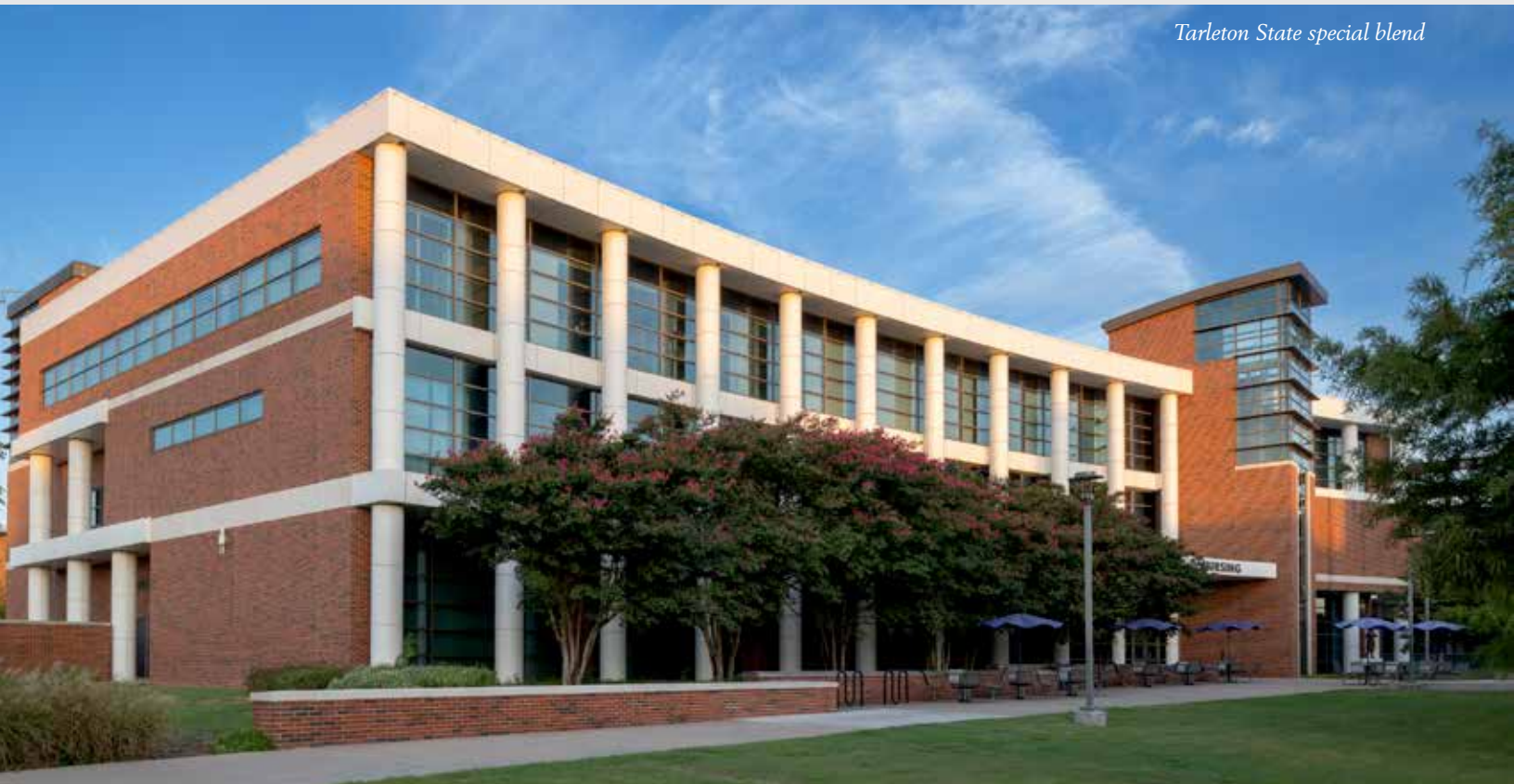
Tarleton State special blend