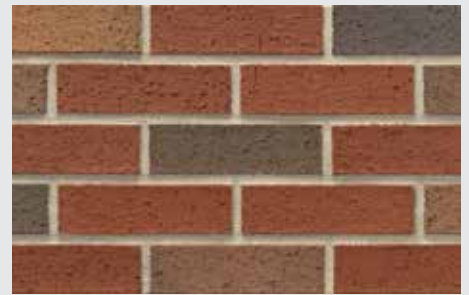
Windsor Park (004)