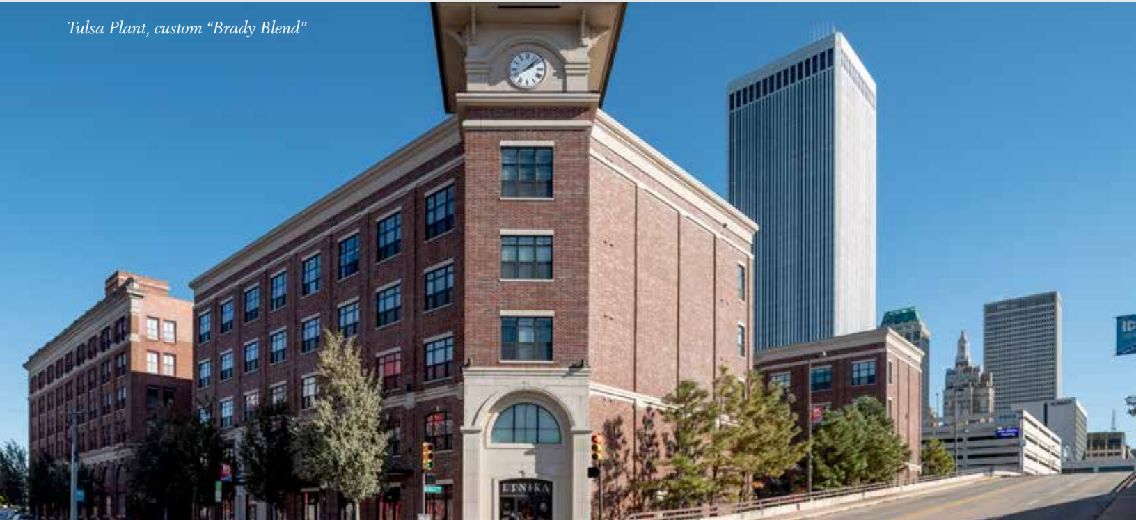
Tulsa Plant, custom “Brady Blend”