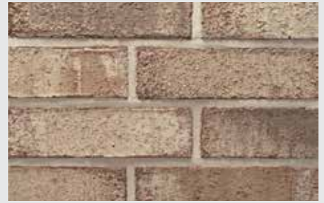
Old Town (007)