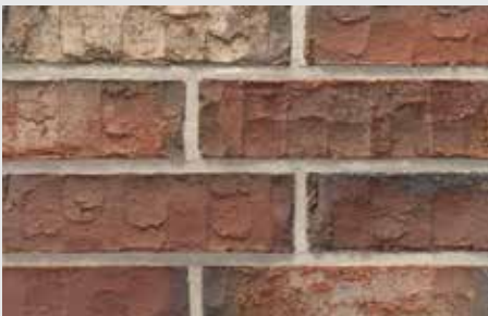
Gunnison River HT (045)